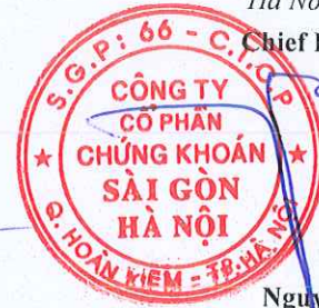
Nguyen Chi Thanh