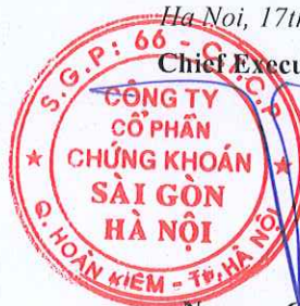
Nguyen Chi Thanh