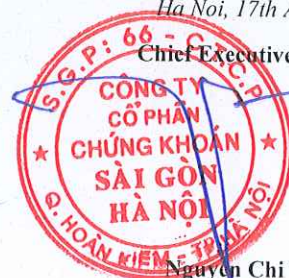
Nguyen Chi Thanh